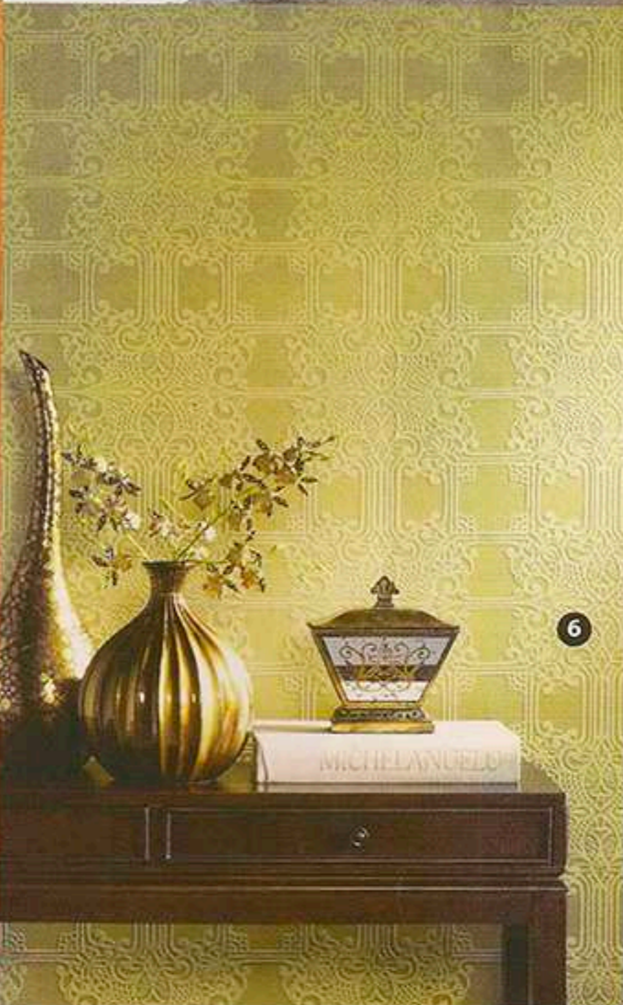
6 | Make a formal statement with The Plaza from the 18 Karat II Collection by Ronald Redding Designs for York Wallcoverings. The design features a glass-bead pattern in gold on gold (pictured), pewter on cream, pewter on pearl beige and black on white. Washable, unpasted and strippable, the wall covering is made from harvested renewable resources and includes beads made of recycled windshield glass. $150.99 per single roll (27 inches wide by 27 feet long) and sold in double-roll bolts only. Sherwin-Williams stores or yorkwall.com .